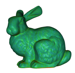
Fig. 2: An analysis of correctness: A comparison of several different reconstructions of the Bunny dataset at depth d = 9 created with the distributed implementation. The table summarizes the size of each model, and the maximum and the average distance of each vertex from the ground-truth. The image on the right shows the distribution of error across the p = 8 model. The color is used to show \delta values over the surface with \delta = 0.0 colored blue and \delta = 1.0 colored red.

second, we evaluate the scalability of our parallel implementation.