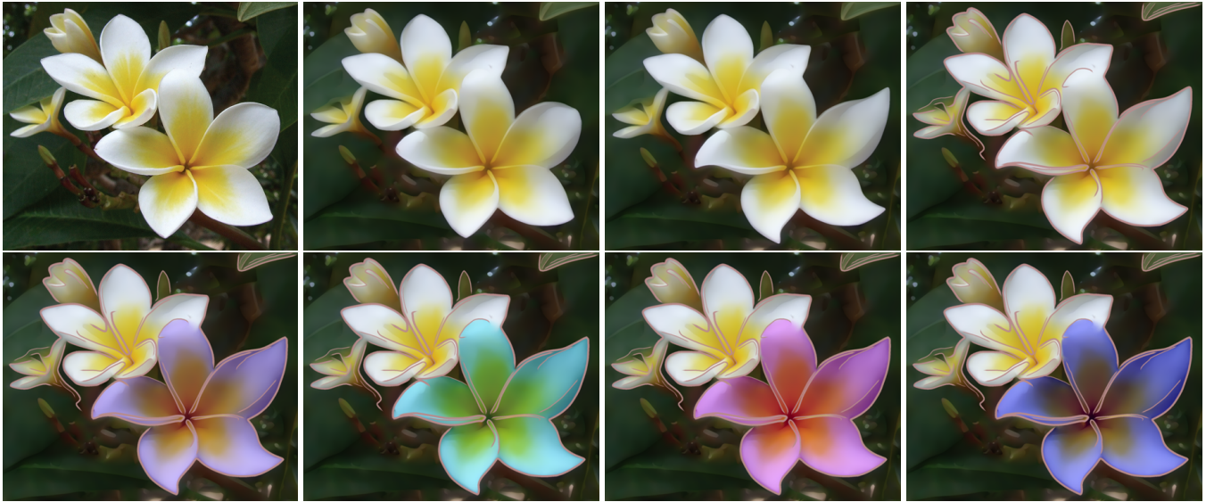
Figure 15: More intermediate editing and stylization results on the flower. Upper (left to right): raster image, smoothed vectorized image, shape editing on the vectorized image. Bottom: four different color editing results on the frontal flower with free-style strokes.