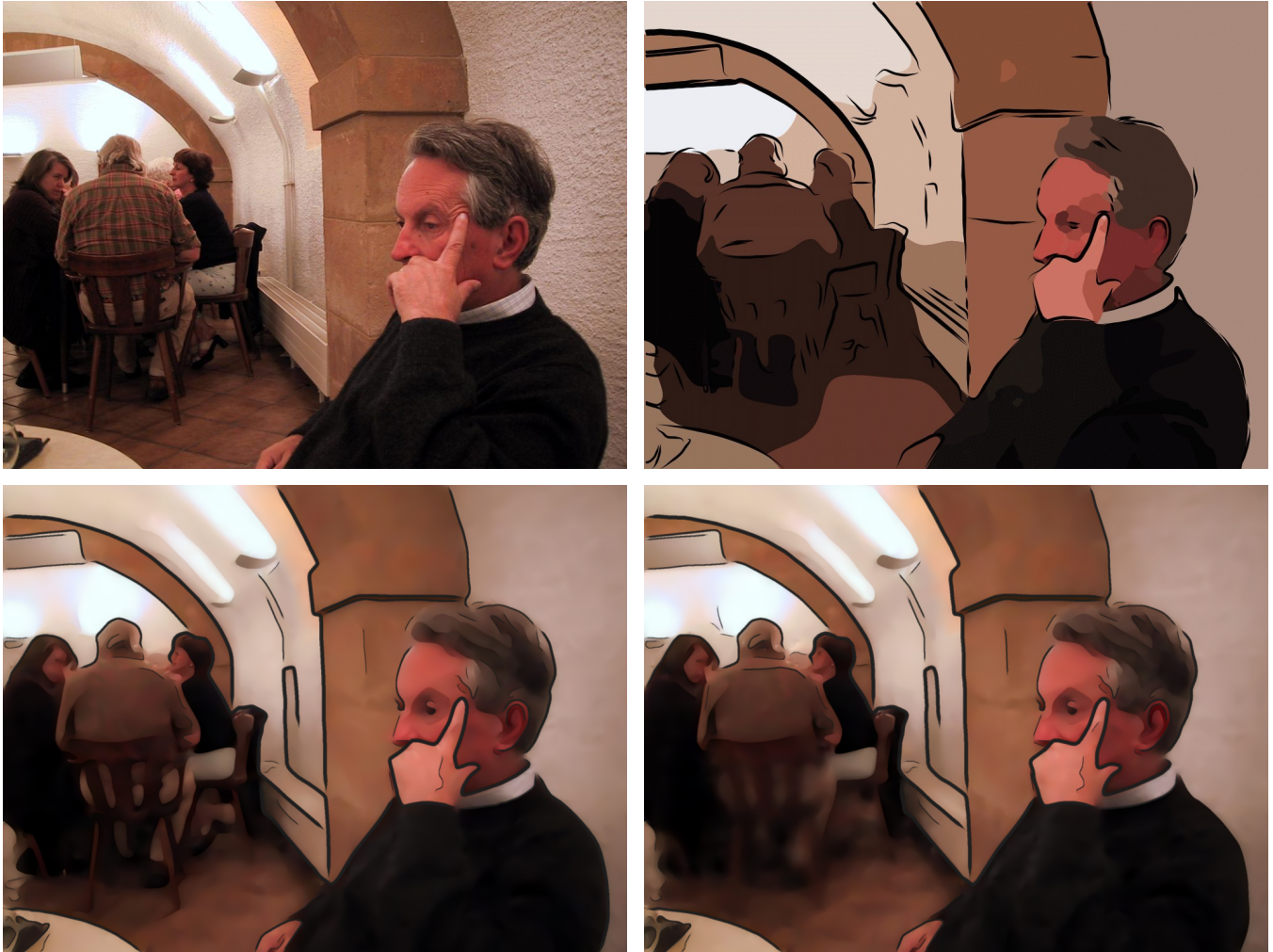
Figure 22: Our stylization results (Bottom Left and Bottom Right, weakened color variations within regions), in comparison with a result from [DeCarlo and Santella 2002] (Upper Right, regions filled with constant colors). Both methods show visually interesting results, but with different stylization emphases.