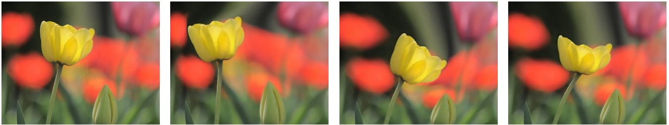
Figure 16: Feature manipulation. Left to right: Raster image and three vector-based shape manipulation results with feature rotation, translation and deformation, respectively.