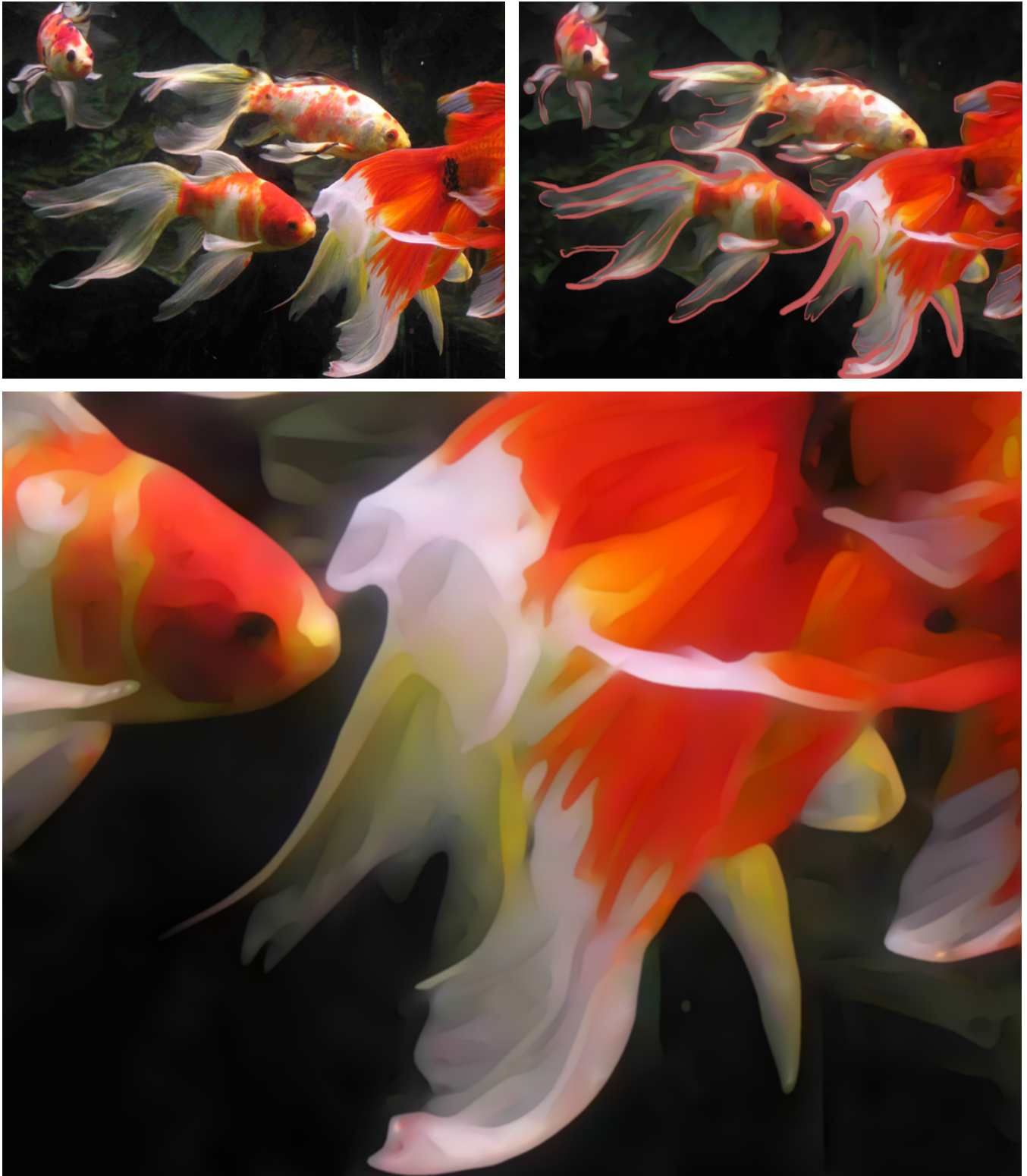
Figure 18: Stylization and cropped magnification (8x) results.