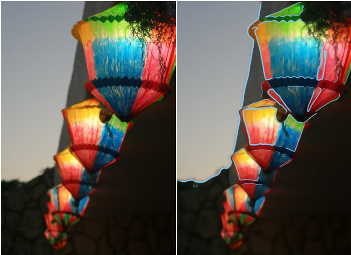
Figure 21: Another stylization example.