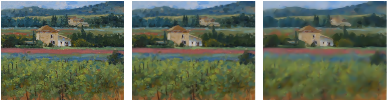
Figure 20: Multilevel abstraction. Left: Original raster image. Middle: Finest level abstraction based on vectorization. Right: Coarsest level abstraction based on vectorization.